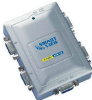
(KVS-14) 1 In 4 Out