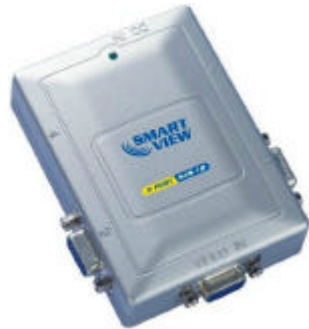
(KVS-12) 1 In 2 Out