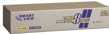
(VS-818PF) 1 In 8 Out