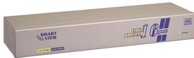
(VS-8116PF) 1 In 16 Out