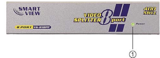
1. Power LED