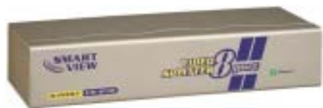
(VS-818) 1 In 8 Out