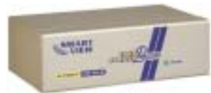
(VS-812) 1 In 2 Out