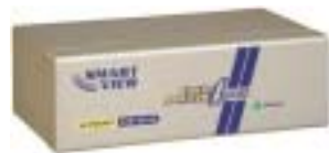
(VS-814) 1 In 4 Out