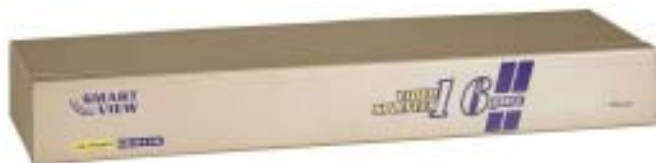
(VS-8116) 1 In 16 Out