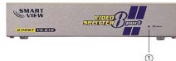
1. Power LED